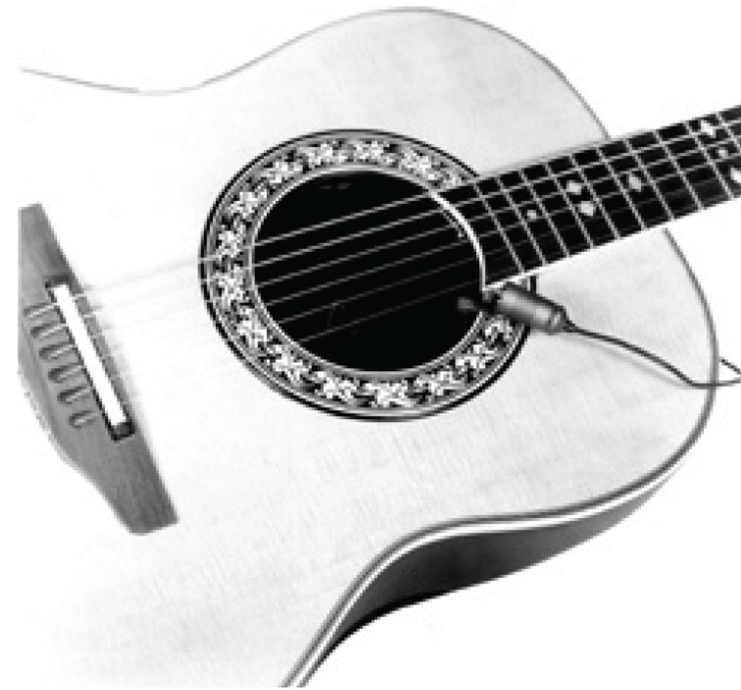
FIGURE 4: GUITAR MOUNTING

To hold the microphone cable in place, remove the paper backing from the supplied cable clips, affix the clips to a suitable flat surface, and insert the cable in the clip slot.