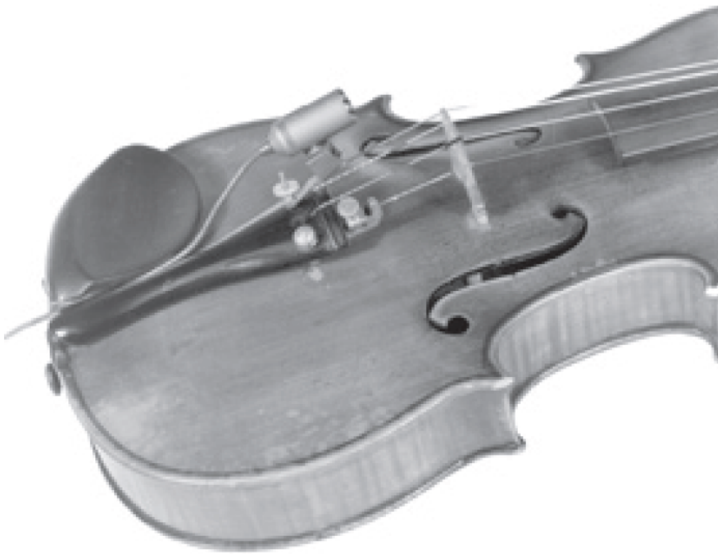
FIGURE 2: VIOLIN MOUNTING—EXPANSION MOUNT