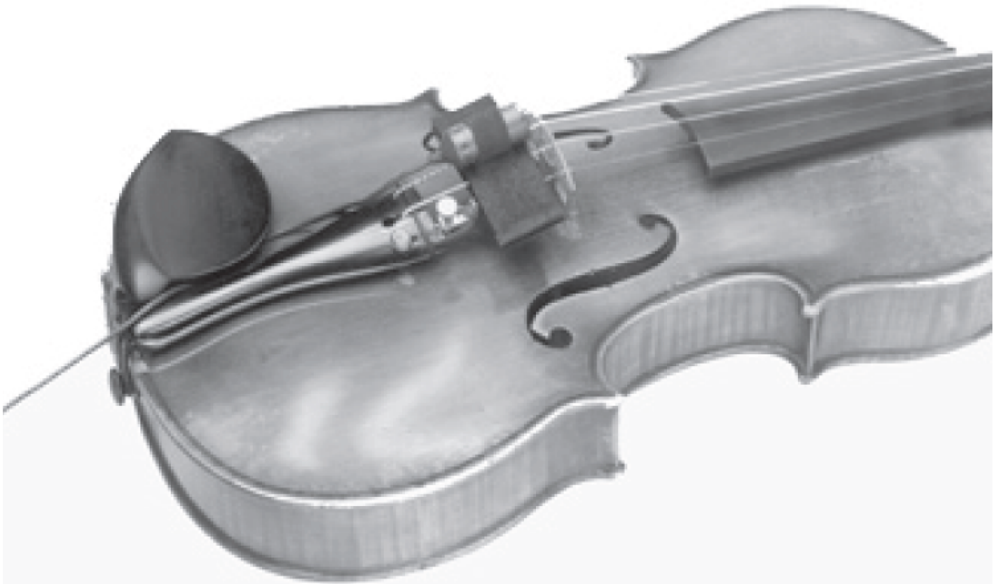
FIGURE 3: VIOLIN MOUNTING—CLOTH MOUNTING ADAPTER