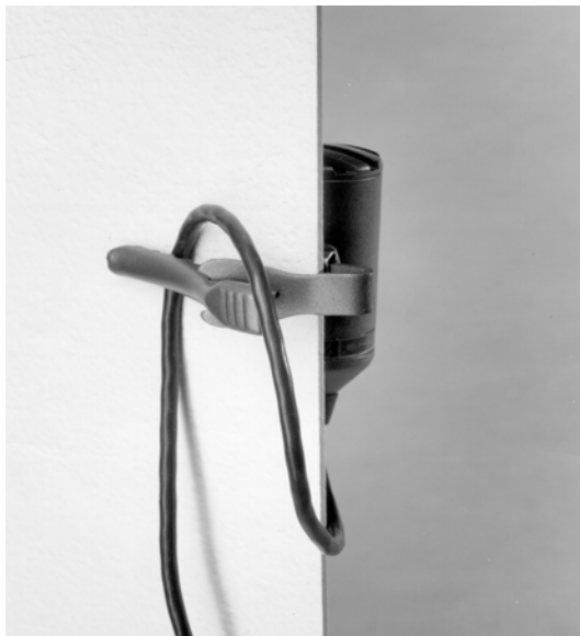
CABLE ANCHORING FIGURE 4

Insert the SM11 in the tie clasp and anchor the cable as shown in Figure 4. Affix the clasp to a tie, shirt, or blouse. Note that the microphone can be swiveled 360° in its holder for left, right, or vertical ("pen clip") use.